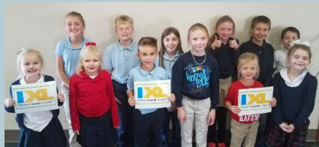
Congratulations to this month's IXL winners!

Wednesday, October 15 th - 2pm dismissal