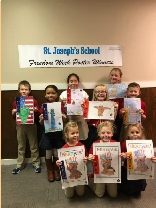
CONGRATULATIONS TO OUR SERTOMA POSTER WINNERS